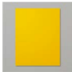
Crushed Curry 8- 1/2" X 11" Cardstock - 131199