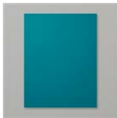
Pretty Peacock 8- 1/2" X 11" Cardstock - 150880