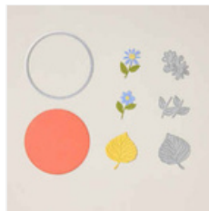
Detailed Flora Dies (English) - 168664