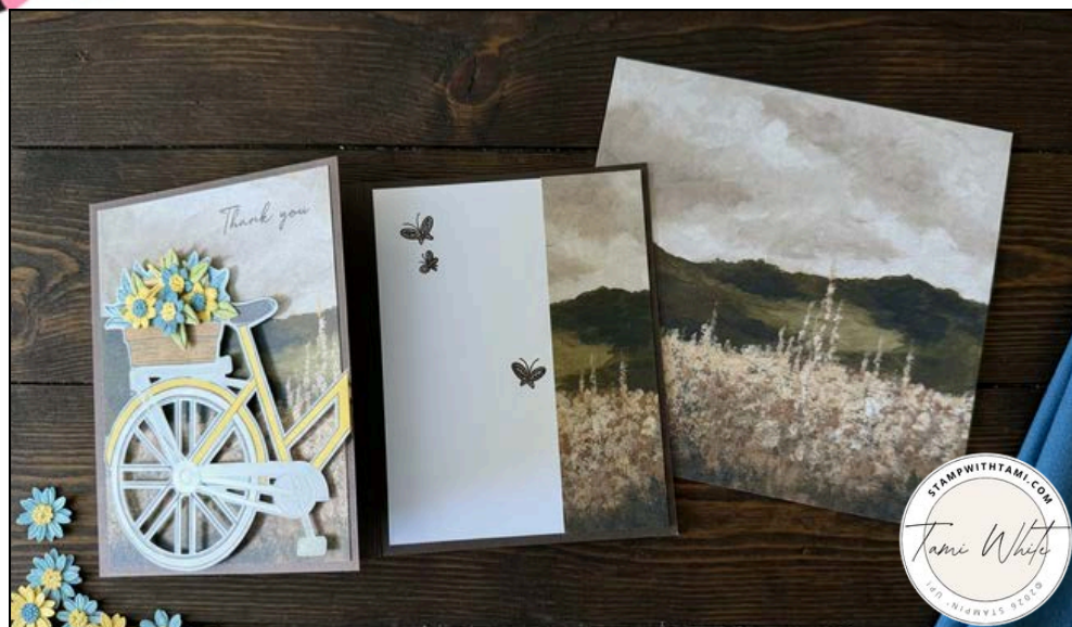
BIKES & BLOOMS Z FOLD CARD

Tami White tami@stampwithtami.com www.stampwithtami.com