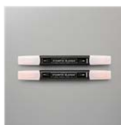
Petal Pink Stampin' Blends Combo Pack - 154893