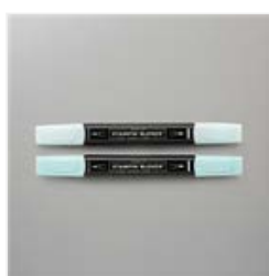
Pool Party Stampin' Blends Combo Pack - 154894