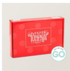
Paper Pumpkin Subscription - 166815