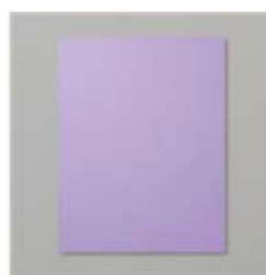
Highland Heather 8-1/2" X 11" Cardstock - 146986