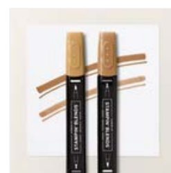
Pecan Pie Stampin' Blends Combo Pack - 161674