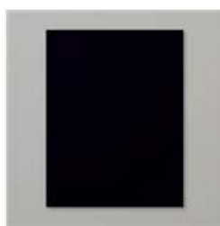
Basic Black 8-1/2" X 11" Cardstock - 121045