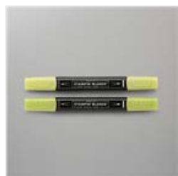
Granny Apple Green Stampin' Blends Combo Pack - 154885