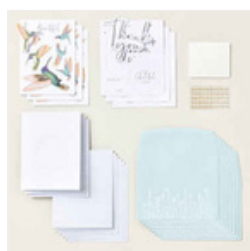
Fluttering Garden Paper Pumpkin Refill (English) - 168629

Tami White tami@stampwithtami.com www.stampwithtami.com