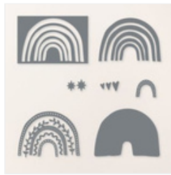
Sunshine Vibes Dies - 165151