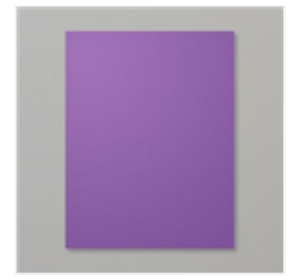
Gorgeous Grape 8- 1/2" X 11" Cardstock 146987