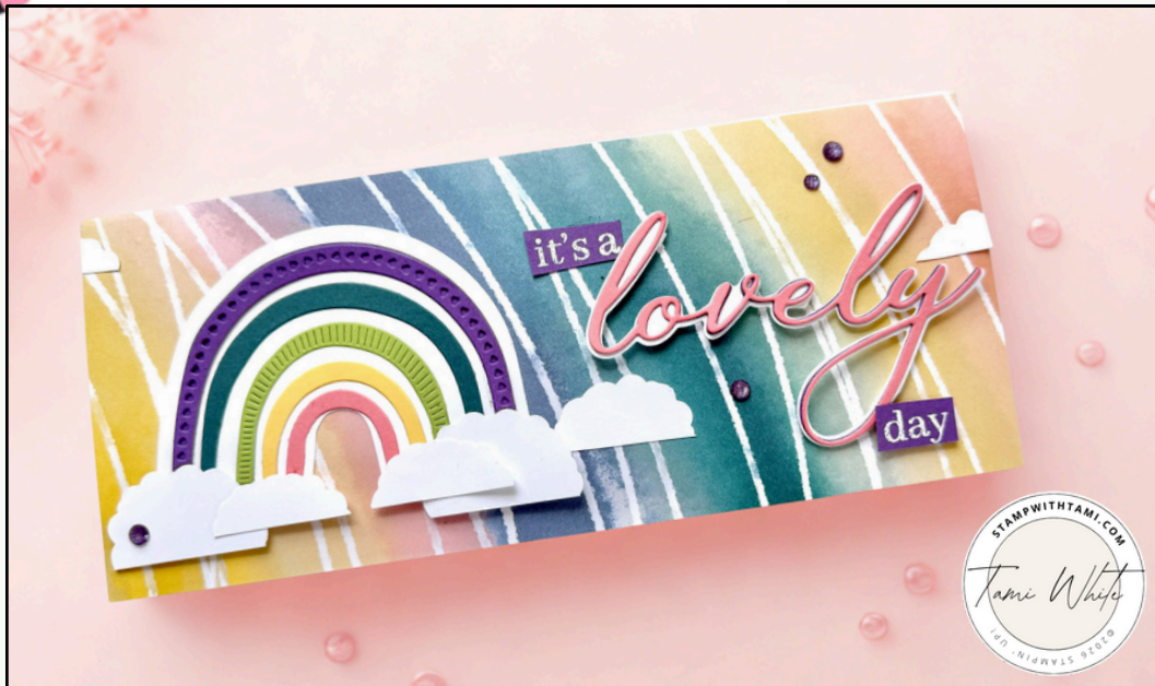
LOVELY DAY - SLIMLINE CARD

Tami White tami@stampwithtami.com www.stampwithtami.com