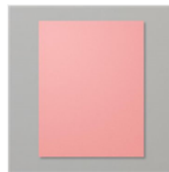
Flirty Flamingo 8- 1/2" X 11" Cardstock - 141416