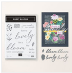
Sweet Blooms Bundle (English) - 165189

Tami White tami@stampwithtami.com www.stampwithtami.com