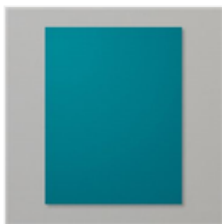
Pretty Peacock 8- 1/2" X 11" Cardstock - 150880