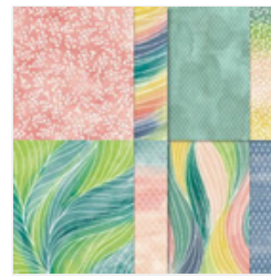
Painted Illusions 12" X 12" Designer Series Paper - 167977