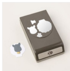
Woolly Friends Builder Punch - 166887