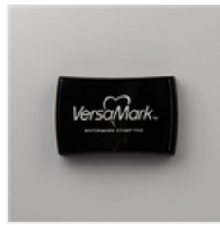
Versamark Pad - 102283