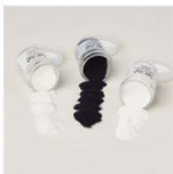
Basics Wow! Embossing Powder - 165679