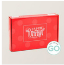
Paper Pumpkin Subscription - 166815