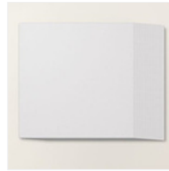
Basic White 12" X 12" (30.5 X 30.5 Cm) Thick Cardstock - 166782