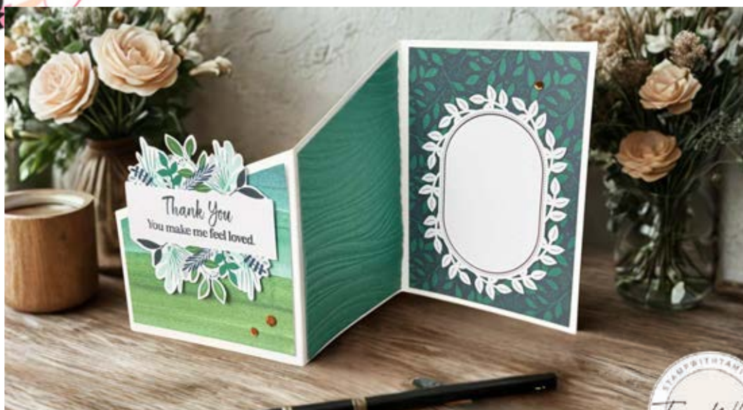
Angled Z Fold Card

Tami White tami@stampwithtami.com www.stampwithtami.com