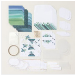
Watercolor In Bloom Paper Pumpkin Refill - 167839

Tami White tami@stampwithtami.com www.stampwithtami.com