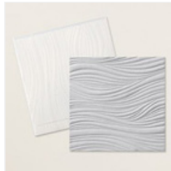
Soft Waves 3D Embossing Folder - 164695