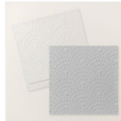
Hearts Of Love 3D Embossing Folder - 167071