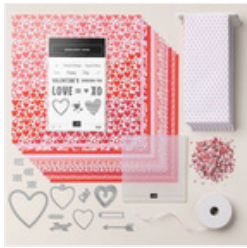
Made With Love Suite Collection (English) - 167079

Tami White tami@stampwithtami.com www.stampwithtami.com