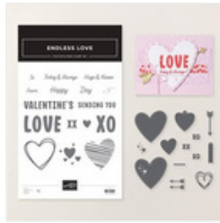
Endless Love Bundle (English) - 167062