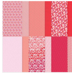
Made With Love 12" X 12" (30.5 X 30.5 Cm) Designer Series Paper - 167054