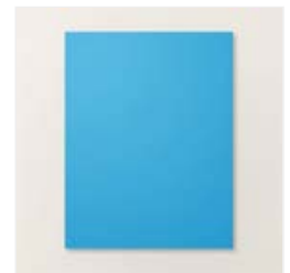
Azure Afternoon 8- 1/2" X 11" Cardstock - 161719