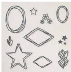
Swirled Designs Dies - 167032