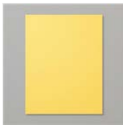
Daffodil Delight 8- 1/2" X 11" Cardstock - 119683