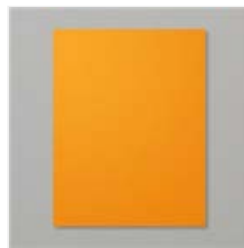
Pumpkin Pie 8-1/2" X 11" Cardstock - 105117