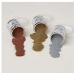
Metallics Wow! Embossing Powder - 165678