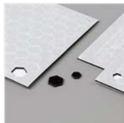
Black Stampin' Dimensionals Combo Pack - 150893