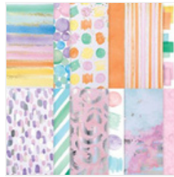
Splash Of Sparkles 12" X 12" Specialty Designer Series Paper - 167200