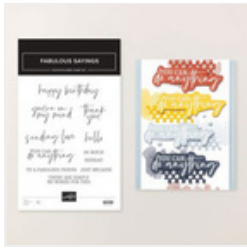
Fabulous Sayings Photopolymer Stamp Set (English) - 167972

Tami White tami@stampwithtami.com www.stampwithtami.com