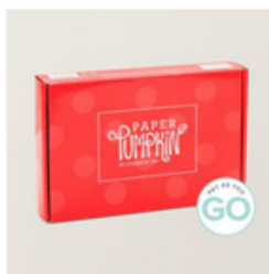
Paper Pumpkin Subscription - 166815