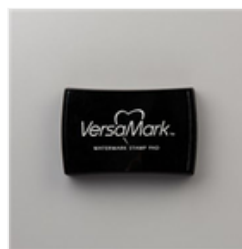
Versamark Pad - 102283