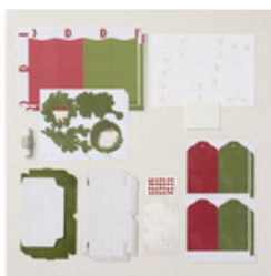
Wrapped In Cheer Paper Pumpkin Refill - 167840