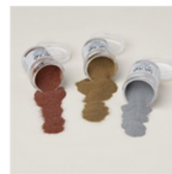
Metallics Wow! Embossing Powder - 165678