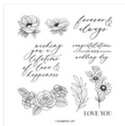
Lifetime Of Love Cling Stamp Set (English) - 162574

Tami White tami@stampwithtami.com www.stampwithtami.com