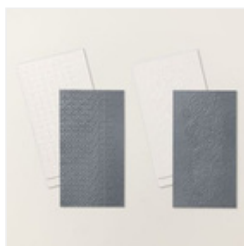
Glass & Gardens Embossing Folders - 165597