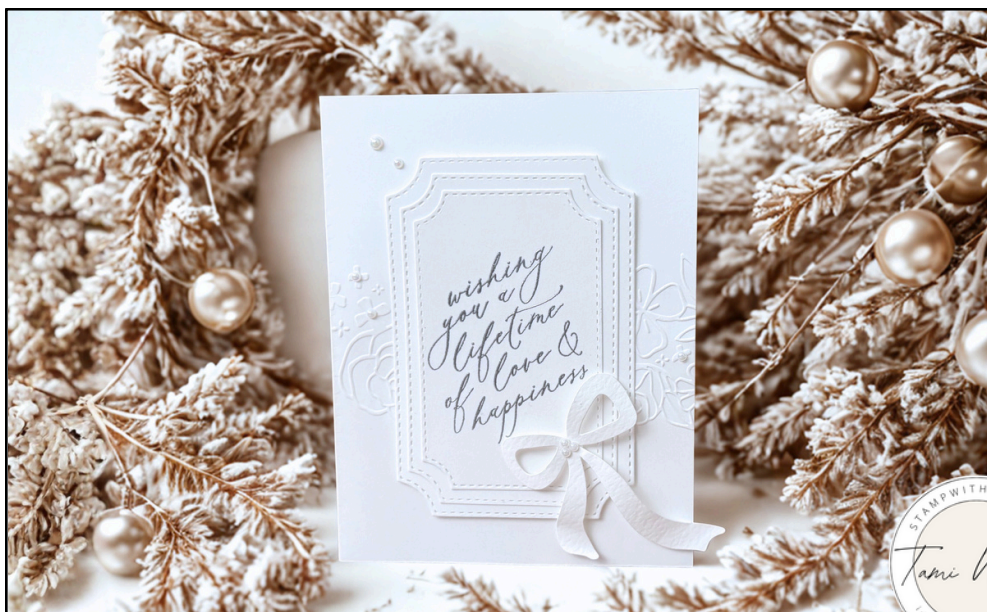
LOVE & HAPPINESS CARD

Tami White tami@stampwithtami.com www.stampwithtami.com