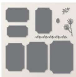
Branching Out Dies - 165775