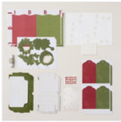
Wrapped In Cheer Paper Pumpkin Refill - 167840

Tami White tami@stampwithtami.com www.stampwithtami.com