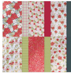
Traditions Of Christmas 12" X 12" (30.5 X 30.5 Cm) Specialty Designer Series Paper - 165853