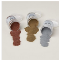
Metallics Wow! Embossing Powder - 165678