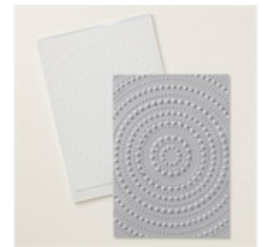
Dotted Circles 3D Embossing Folder - 163789