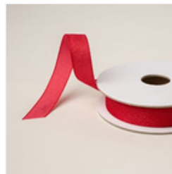
Real Red 1/2" (1.3 Cm) Shiny Ribbon - 165876