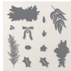
Christmas Greenery Dies - 165872