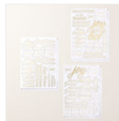
Greetings For You Mix & Match Ephemera Pack - 166208