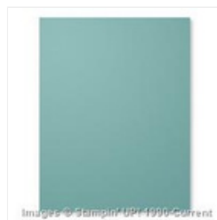
Lost Lagoon 8-1/2" X 11" Cardstock - 133679