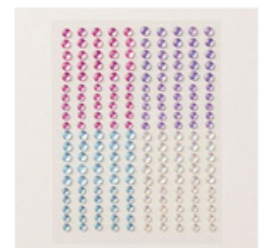
Frosted Iridescent Dots - 165766