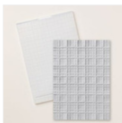
Forever Plaid 3D Embossing Folder - 164049