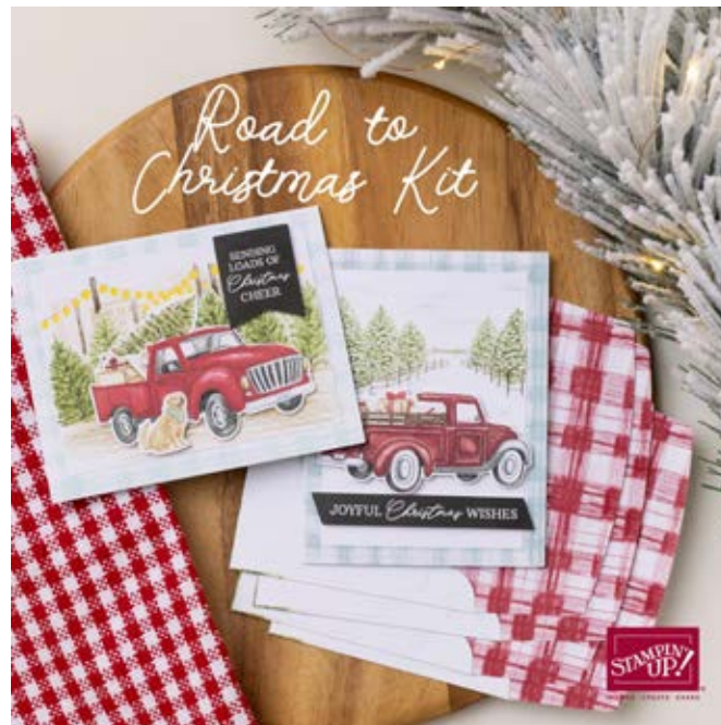
Road To Christmas Kit - 166227

Tami White tami@stampwithtami.com www.stampwithtami.com