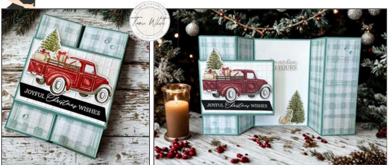
Road to Christmas Double Gate Card Fold See video tutorial on my blog post for fold