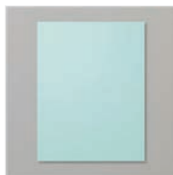
Pool Party 8-1/2" X 11" Cardstock - 122924