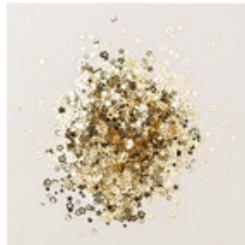
Gold Shaker Stars - 166065