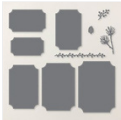
Branching Out Dies - 165775