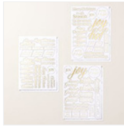
Greetings For You Mix & Match Ephemera Pack (English) - 166208