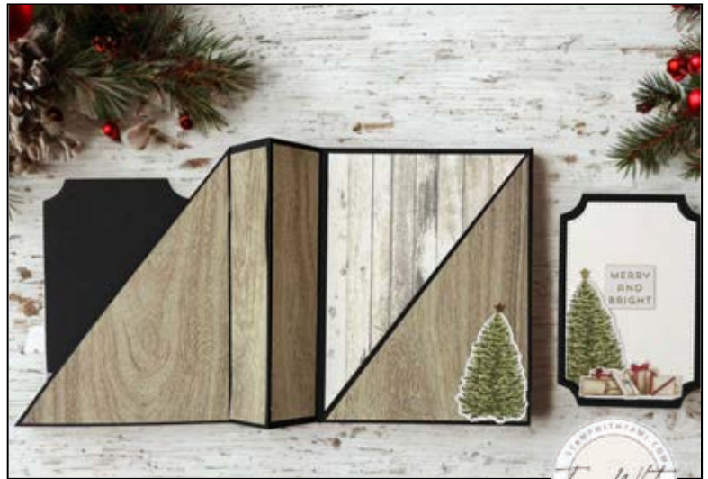
Road to Christmas Accordion Pocket Fold See video for how to create the fold on my blog post