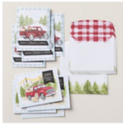
Road To Christmas Kit - 166227

Tami White tami@stampwithtami.com www.stampwithtami.com