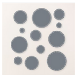
Spotlight On Nature Dies - 163580