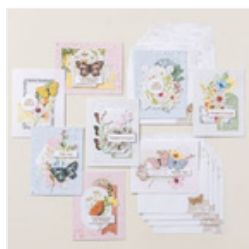
Heirloom Arrangements Kit (English) - 165007

Tami White tami@stampwithtami.com www.stampwithtami.com