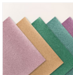
2024-2026 In Color™ Glimmer 12" X 12" (30.5 X 30.5 Cm) Specialty Paper - 163771