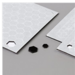
Black Stampin' Dimensionals Combo Pack - 150893