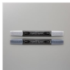
Basic Black Stampin' Blends Combo Pack - 154843