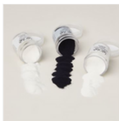
Basics Wow! Embossing Powder - 165679