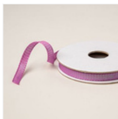
Petunia Pop 1/4" (6.4 Mm) Iridescent Ribbon - 166203