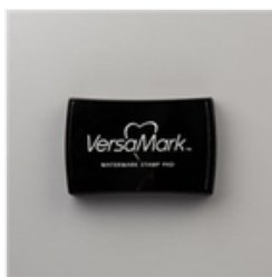
Versamark Pad - 102283