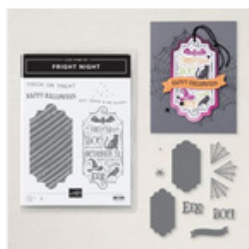
Fright Night Bundle (English) - 166107

Tami White tami@stampwithtami.com www.stampwithtami.com