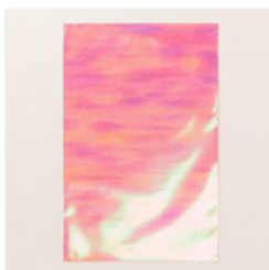
Iridescent Treat Bags - 166204