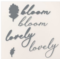
Sweet Blooms Dies (English) - 165186