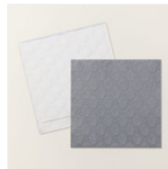
Damask Designs Embossing Folder - 165214