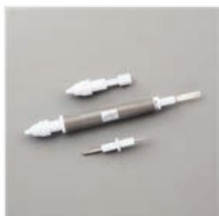
Take Your Pick - 144107