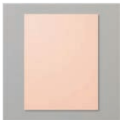
Petal Pink 8-1/2" X 11" Cardstock - 146985