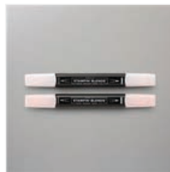
Petal Pink Stampin' Blends Combo Pack - 154893