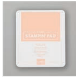
Petal Pink Classic Stampin' Pad - 147108