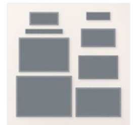
Textured Notes Dies - 165555