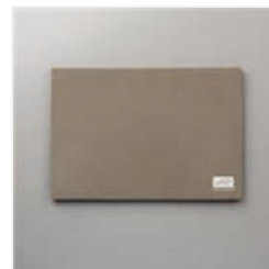
Stampin' Pierce Mat - 126199