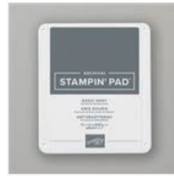
Basic Gray Classic Stampin' Pad - 149165