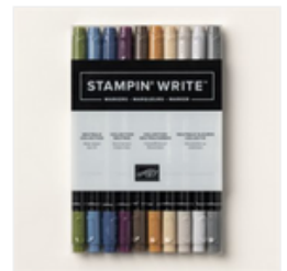
Neutrals Stampin' Write Markers - 161697