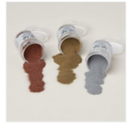
Metallics Wow! Embossing Powder - 165678