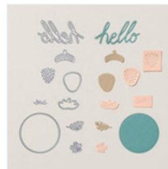
Circle Of Seasons Dies - 167277