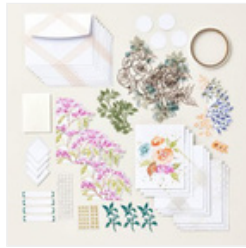
Full Of Charm Paper Pumpkin Refill - 167281