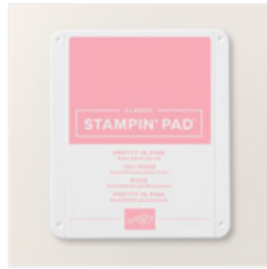
Pretty In Pink Classic Stampin' Pad - 163807