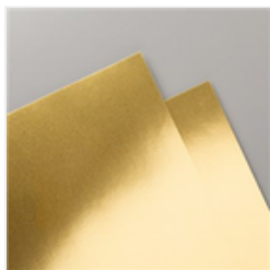
Gold Foil Sheets - 132622