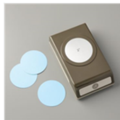
2" (5.1 Cm) Circle Punch - 133782