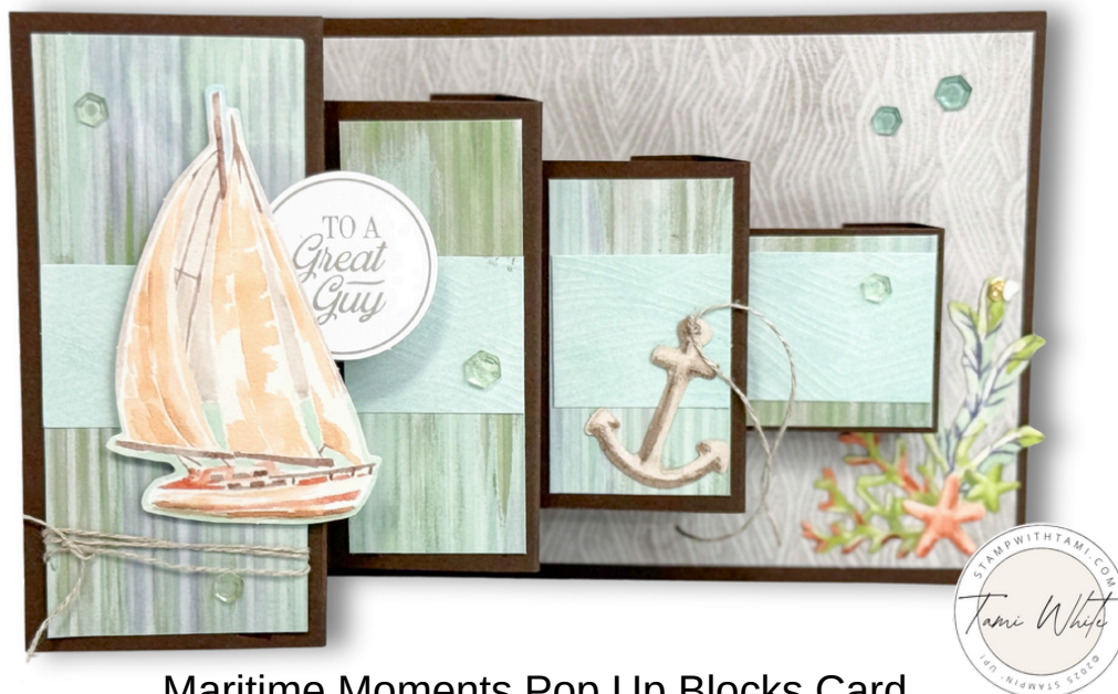
Maritime Moments Pop Up Blocks Card See video on my blog