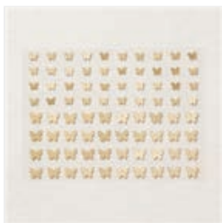
Brushed Brass Butterflies - 158136