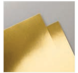
Gold Foil Sheets - 132622