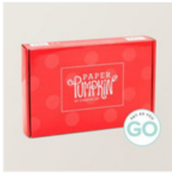
Paper Pumpkin Subscription - 166815

Tami White tami@stampwithtami.com www.stampwithtami.com