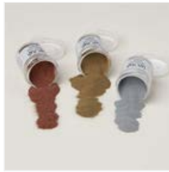
Metallics Wow! Embossing Powder - 165678