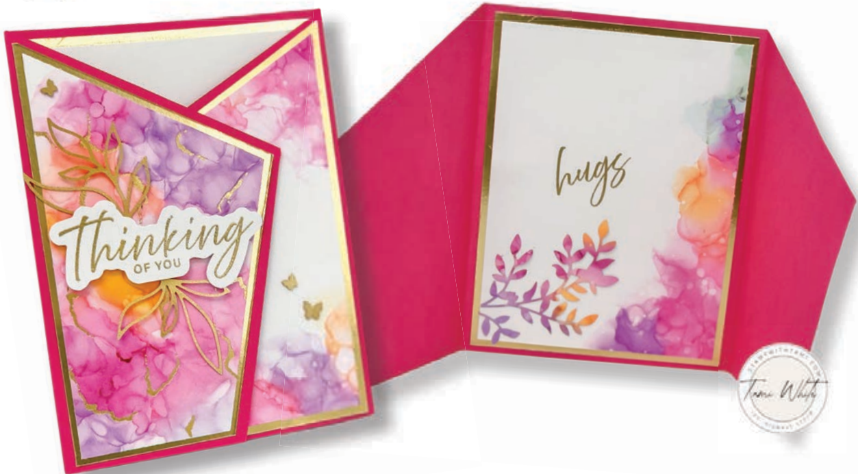
Inked Occasions Angled Gatefold Alternate Paper Pumpkin Kit Tutorial