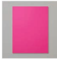
Melon Mambo 8- 1/2" X 11" Cardstock - 115320