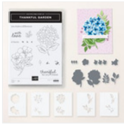
Thankful Garden Bundle (English) - 165534

Tami White tami@stampwithtami.com www.stampwithtami.com