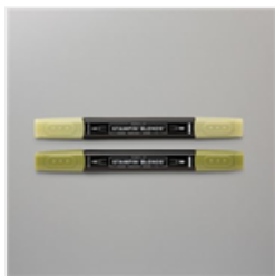
Old Olive Stampin' Blends Combo Pack - 154892