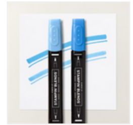
Azure Afternoon Stampin' Blends Combo Pack - 161672