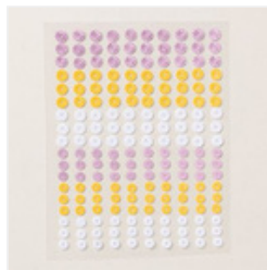
Starburst Sequins - 165539