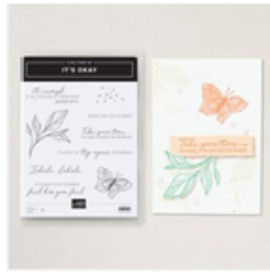
It's Okay Cling Stamp Set (English) - 165425