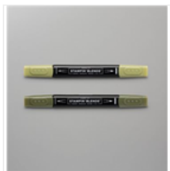
Mossy Meadow Stampin' Blends Combo Pack - 154890