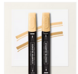
Peach Pie Stampin' Blends Combo Pack - 163827