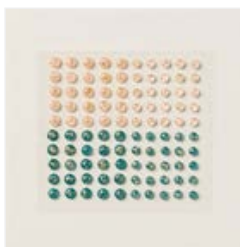
Petal Pink & Pretty Peacock Foiled Gems - 162587