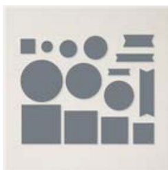
Stylish Shapes Dies - 159183