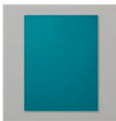
Pretty Peacock 8-1/2" X 11" Cardstock - 150880