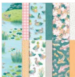
Lily Pond Lane 6" X 6" (15.2 X 15.2 Cm) Designer Series Paper - 163342