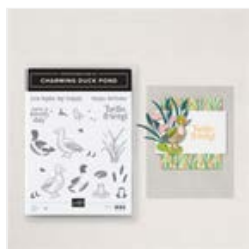
Charming Duck Pond Photopolymer Stamp Set (English) - 163344

Tami White tami@stampwithtami.com www.stampwithtami.com