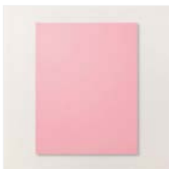
Pretty In Pink 8-1/2" X 11" Cardstock - 163793