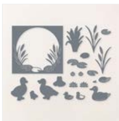
Charming Duck Pond Dies - 163349