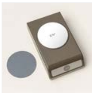
2-3/8" (6 Cm) Circle Punch - 161354