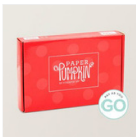
Paper Pumpkin Subscription - 166815