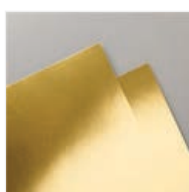
Gold Foil Sheets - 132622