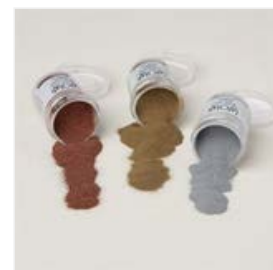
Metallics Wow! Embossing Powder - 165678