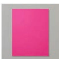
Melon Mambo 8- 1/2" X 11" Cardstock - 115320