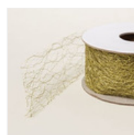
Gold 1-1/2" (3.8 Cm) Open Weave Trim - 165715