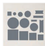
Stylish Shapes Dies - 159183