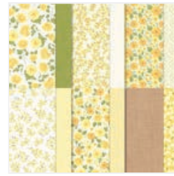
Floral Delight 12" X 12" Series Paper - 164700