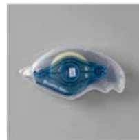
Stampin' Seal+ - 149699