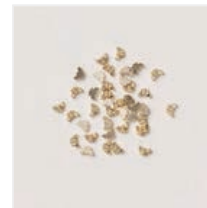
Tiny Bee Trinkets - 164714