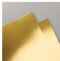
Gold Foil Sheets - 132622