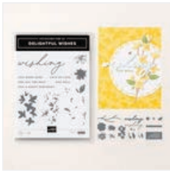
Delightful Wishes Bundle (English) - 164710

Tami White tami@stampwithtami.com www.stampwithtami.com