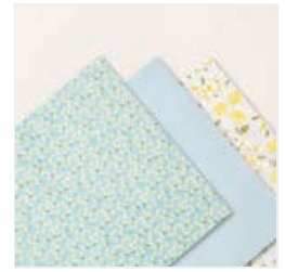
Floral & Gingham Vellum 12" X 12" Specialty Designer Series Paper - 164713