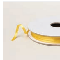
Daffodil Delight 1/8" Satin Ribbon - 164715