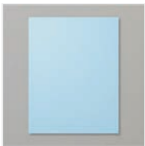
Balmy Blue 8-1/2" X 11" Cardstock - 146982