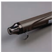
Heat Tool - 129053