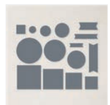
Stylish Shapes Dies - 159183