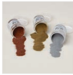
Metallics Wow! Embossing Powder - 165678