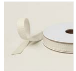
Basic Beige 3/8" (1 Cm) Bordered Ribbon - 163788