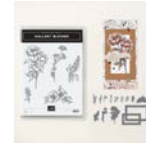
Gallery Blooms Bundle