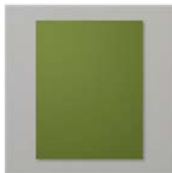
Mossy Meadow 8- 1/2" X 11" Cardstock - 133676