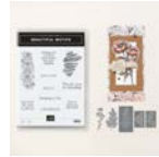
Beautiful Motifs Bundle