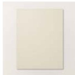
Basic Beige 8-1/2" X 11" Cardstock - 164511