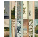
Beautiful Gallery Designer Series Paper