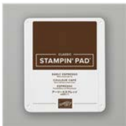
Early Espresso Classic Stampin' Pad - 147114