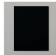
Basic Black 8-1/2" X 11" Cardstock - 121045