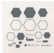
Meant To Bee Dies - 166582