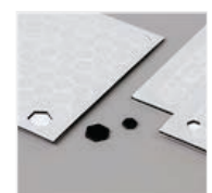
Black Stampin' Dimensionals Combo Pack 150893