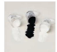
Basics Wow! Embossing Powder - 165679