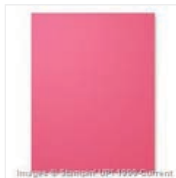
Strawberry Slush 8-1/2" X 11" Card Stock - 131295