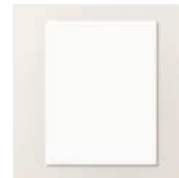
Basic White 8-1/2" X 11" Cardstock - 166780