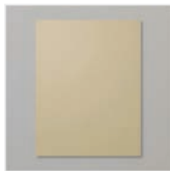
Crumb Cake 8-1/2" X 11" Cardstock - 120953