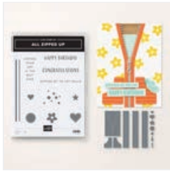
All Zipped Up Bundle (English) - 165402

Tami White tami@stampwithtami.com www.stampwithtami.com