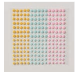
Party Dots - 164602