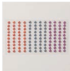
Adhesive-Backed Pearl Trio - 163319