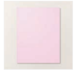
Bubble Bath 8-1/2" X 11" Cardstock - 161718