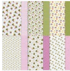
Cute As Can Bee 12" X 12" (30.5 X 30.5 Cm) Designer Series Paper - 166621