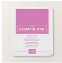
Petunia Pop Classic Stampin' Pad - 163811