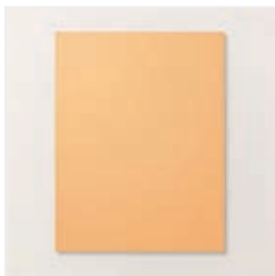
Peach Pie 8-1/2" X 11" Cardstock - 163799