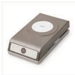
1-3/4" (4.4 Cm) Circle Punch - 119850