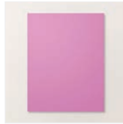
Petunia Pop 8-1/2" X 11" Cardstock - 163801