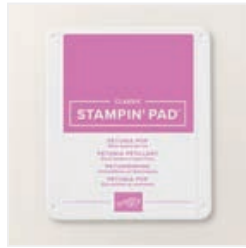
Petunia Pop Classic Stampin' Pad - 163811