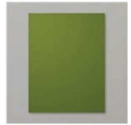
Mossy Meadow 8- 1/2" X 11" Cardstock - 133676