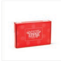
Prepaid Paper Pumpkin Subscription 1- Month - 137858