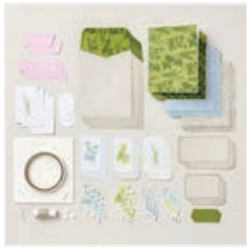
Hello Spring Paper Pumpkin Refill - 166244

Tami White tami@stampwithtami.com www.stampwithtami.com