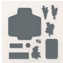
Grow With Love Dies - 164803