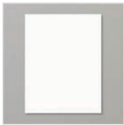
Basic White 8-1/2" X 11" Cardstock - 159276