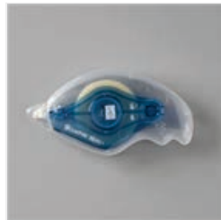
Stampin' Seal+ - 149699