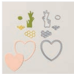
Spring Is In The Air Dies - 166237