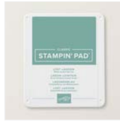
Lost Lagoon Classic Stampin' Pad - 161678