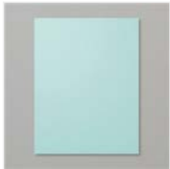
Pool Party 8-1/2" X 11" Cardstock - 122924