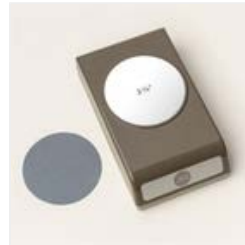
2-3/8" (6 Cm) Circle Punch - 161354