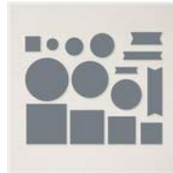
Stylish Shapes Dies - 159183