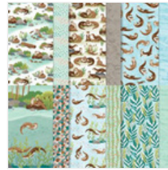
Otterly Adorable 12" X 12" (30.5 X 30.5 Cm) Designer Series Paper - 164936