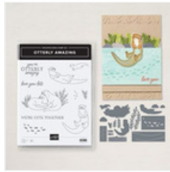
Otterly Amazing Bundle (English) - 164933