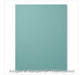
Lost Lagoon 8-1/2" X 11" Cardstock - 133679