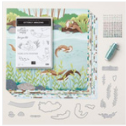
Otterly Adorable Suite Collection (English) - 164939

Tami White tami@stampwithtami.com www.stampwithtami.com