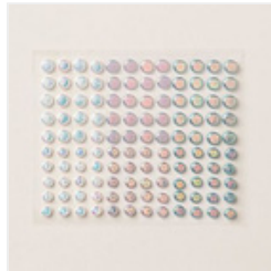
Riverside Irregular Pearls - 164937