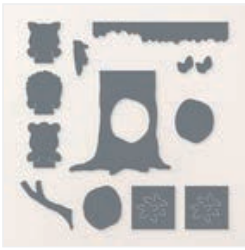
Peekaboo Forest Dies - 165390

Tami White tami@stampwithtami.com www.stampwithtami.com