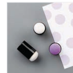
Sponge Daubers - 133773