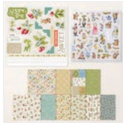
Storybook Moments 12" X 12" Designer Series Paper & Sticker Sheet (English)