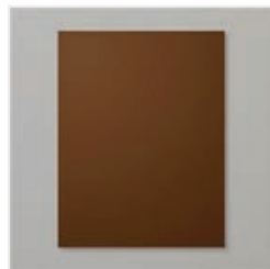
Early Espresso 8- 1/2" X 11" Cardstock - 119686