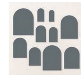
Everyday Arches Dies - 164629