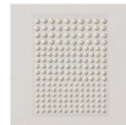
Antique Pearls - 164679