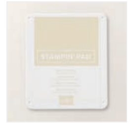
Basic Beige Classic Stampin' Pad - 163806