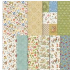
Storybook Moments 12" X 12" Specialty Designer Series Paper