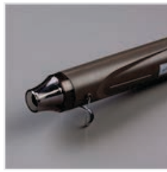
Heat Tool - 129053