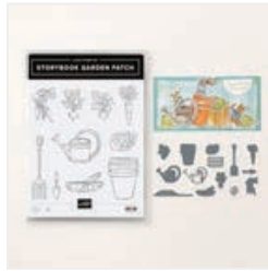
Storybook Garden Patch Bundle - 164667