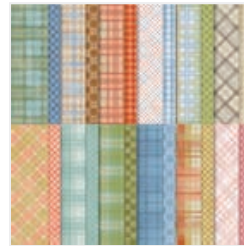
Timeless Plaid 6" X 6" Designer Series Paper - 164678