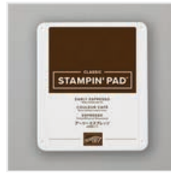
Early Espresso Classic Stampin' Pad - 147114