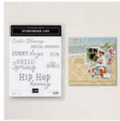
Storybook Life Photopolymer Stamp Set