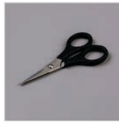
Paper Snips Scissors - 103579