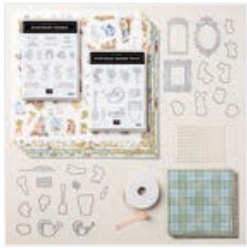
Storybook Moments Suite Collection - 164681

Tami White tami@stampwithtami.com www.stampwithtami.com