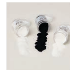
Basics Wow! Embossing Powder - 165679