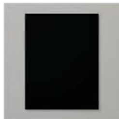
Basic Black 8-1/2" X 11" Cardstock - 121045