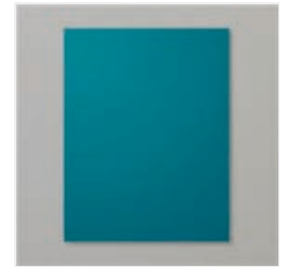
Pretty Peacock 8- 1/2" X 11" Cardstock - 150880