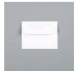
Basic White Medium Envelopes - 159236