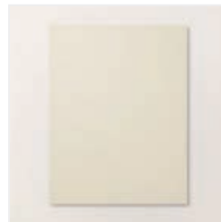
Basic Beige 8-1/2" X 11" Cardstock - 164511