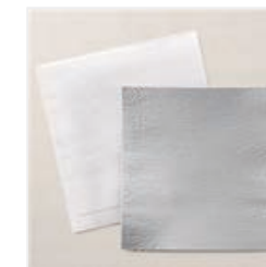
Timber 3D Embossing Folder - 156406