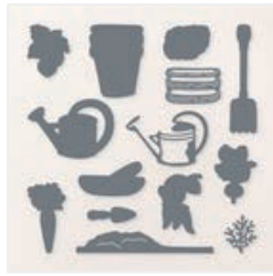
Storybook Garden Patch Dies - 164666