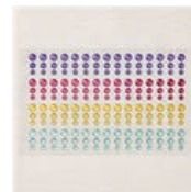
Glossy Dots Assortment - 158827