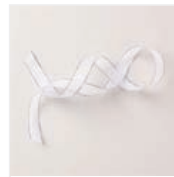
Silver & White 1/2" (1.3 Cm) Sheer Ribbon - 162149