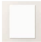
Basic White 8-1/2" X 11" Cardstock - 166780