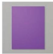
Gorgeous Grape 8-1/2" X 11" Cardstock - 146987