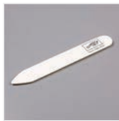
Bone Folder - 102300