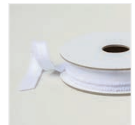
White 3/8" (1 Cm) Frayed Grosgrain Ribbon - 164205