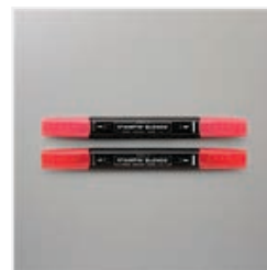
Poppy Parade Stampin' Blends Combo Pack - 154958