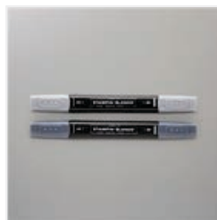
Basic Black Stampin' Blends Combo Pack - 154843