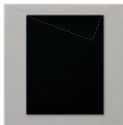
Basic Black 8-1/2" X 11" Cardstock - 121045