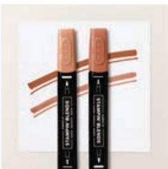
Copper Clay Stampin' Blends Combo Pack - 161662