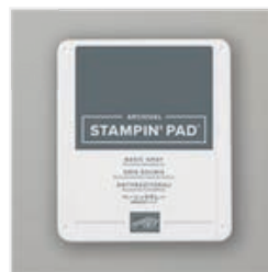
Basic Gray Classic Stampin' Pad - 149165