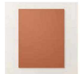
Copper Clay 8-1/2" X 11" Cardstock - 161721