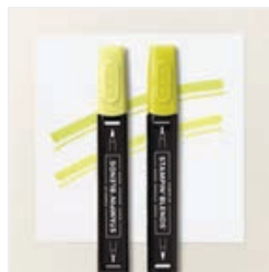
Lemon Lime Twist Stampin' Blends Combo Pack - 161682