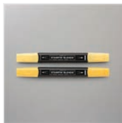
Daffodil Delight Stampin' Blends Combo Pack - 154883