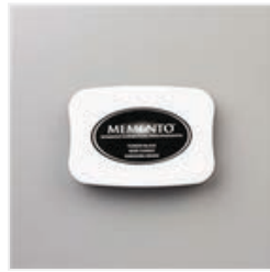
Tuxedo Black Memento Ink Pad - 132708