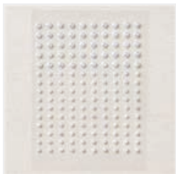
Iridescent Pearl Basic Jewels - 158987