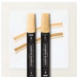
Peach Pie Stampin' Blends Combo Pack - 163827