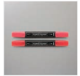
Poppy Parade Stampin' Blends Combo Pack - 154958