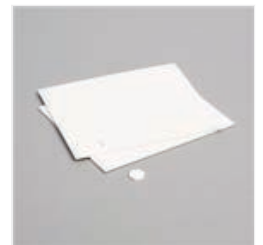
Stampin' Dimensionals - 104430