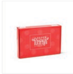
Prepaid Paper Pumpkin Subscription 1- Month - 137858