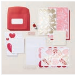
Hearts For You Paper Pumpkin Refill - 166240

Tami White tami@stampwithtami.com www.stampwithtami.com