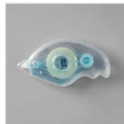
Stampin' Seal - 152813