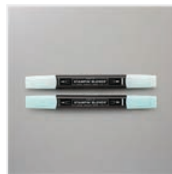
Pool Party Stampin' Blends Combo Pack - 154894