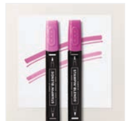
Berry Burst Stampin' Blends Combo Pack - 161681