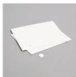
Stampin' Dimensionals - 104430