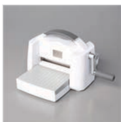
Stampin' Cut & Emboss Machine - 149653