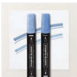
Boho Blue Stampin' Blends Combo Pack - 161659