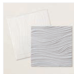
Soft Waves 3D Embossing Folder - 164695