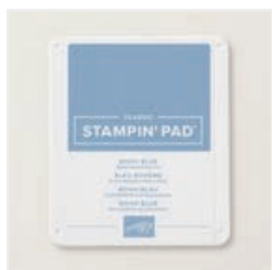
Boho Blue Classic Stampin' Pad - 161650