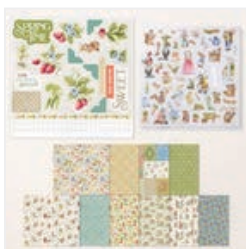
Storybook Moments 12" X 12" (30.5 X 30.5 Cm) Designer Series Paper & Sticker Sheet (English) - 166617