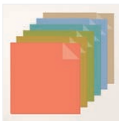
Storybook Life 12" X 12" (30.5 X 30.5 Cm) Two-Tone Cardstock - 166637