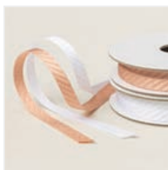
Petal Pink & White 1/4" (6.4 Mm) Diagonal Trim Combo Pack - 163417