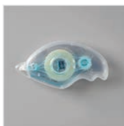
Stampin' Seal - 152813