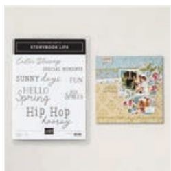
Storybook Life Photopolymer Stamp Set (English) - 166635

Tami White tami@stampwithtami.com www.stampwithtami.com