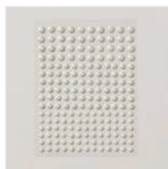
Antique Pearls - 164679