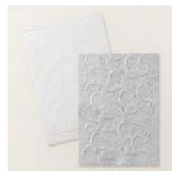
Plaster Painting 3D Embossing Folder - 164656