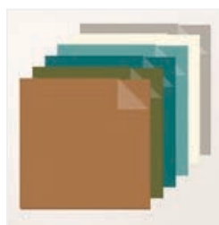
Everyday You & Me 12" X 12" (30.5 X 30.5 Cm) Two-Tone Cardstock - 166631