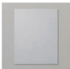
Smoky Slate 8-1/2" X 11" Cardstock - 131202