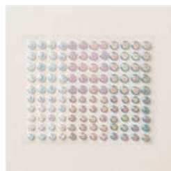
Riverside Irregular Pearls - 164937