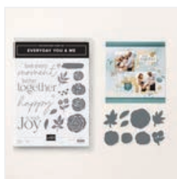
Everyday You & Me Bundle (English) - 167240