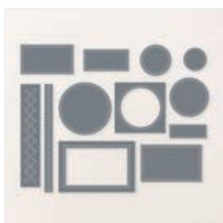
Everyday Details Dies - 162864