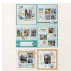
Everyday You & Me Scrapbooking Workshop Kit (English) - 166628

Tami White tami@stampwithtami.com www.stampwithtami.com