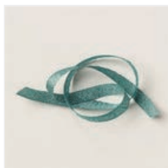
Pretty Peacock & Gold 3/8" (1 Cm) Metallic Ribbon - 162588