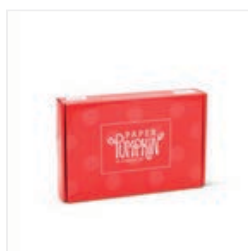
Prepaid Paper Pumpkin Subscription 1-Month - 137858