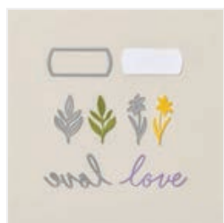
The Love Of Spring Dies - 164396