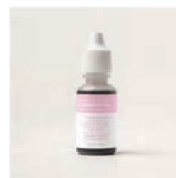
Bubble Bath Classic Stampin' Ink Refill - 161670