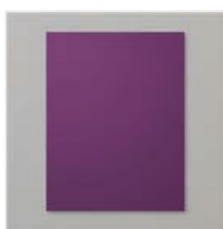
Blackberry Bliss 8-1/2 X 11" Cardstock - 133675