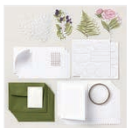
Notes From The Heart Paper Pumpkin Refill - 165640

Tami White tami@stampwithtami.com www.stampwithtami.com