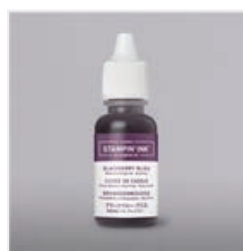
Blackberry Bliss Classic Stampin' Ink Refill - 133648