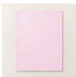
Bubble Bath 8-1/2 X 11" Cardstock - 161718