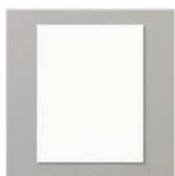
Basic White 8-1/2 X 11" Cardstock - 159276