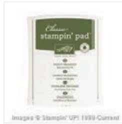
Mossy Meadow Classic Stampin' Pad - 133645