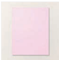
Bubble Bath 8-1/2 X 11" Cardstock - 161718