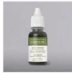
Mossy Meadow Classic Stampin' Ink Refill - 133651