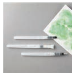
Water Painters - 151298