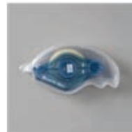
Stampin' Seal+ - 149699