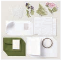
Notes From The Heart Paper Pumpkin Refill - 165640

Tami White tami@stampwithtami.com www.stampwithtami.com