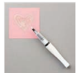
Wink Of Stella Clear Glitter Brush - 141897