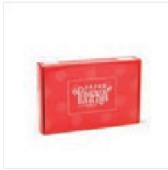
Prepaid Paper Pumpkin Subscription 1-Month - 137858