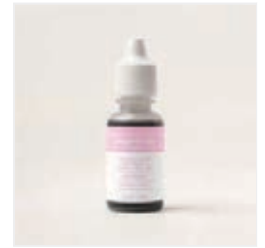
Bubble Bath Classic Stampin' Ink Refill - 161670