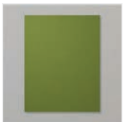
Mossy Meadow 8-1/2 X 11" Cardstock - 133676