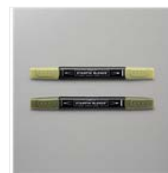
Mossy Meadow Stampin' Blends Combo Pack - 154890