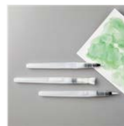
Water Painters - 151298