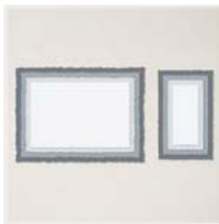
Deckled Rectangles Dies - 159173