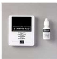
Uninked Stampin' Pad & Whisper White Refill - 147277