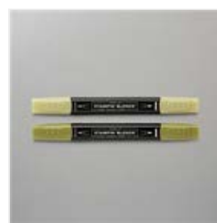
Old Olive Stampin' Blends Combo Pack - 154892