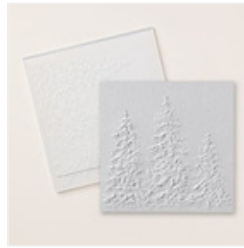
Painted Trees 3D Embossing Folder - 164026