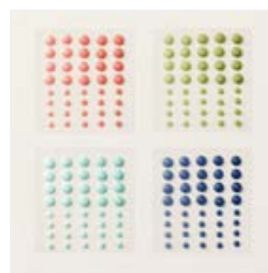
Ombre Matte Decorative Dots - 161448