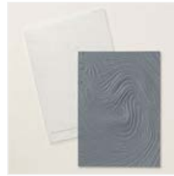
So Swirly Embossing Folder - 163791