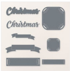
Peaceful Season Dies (English) - 164020