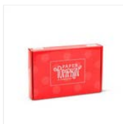
Prepaid Paper Pumpkin Subscription 1- Month - 137858