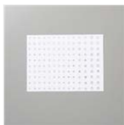
Rhinestone Basic Jewels - 144220