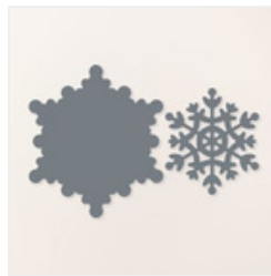
One Of A Kind Dies - 164077