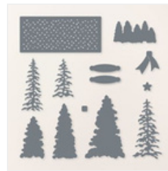
Peaceful Evergreens Dies - 164024