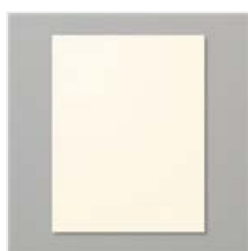
Very Vanilla 8-1/2" X 11" Cardstock - 101650