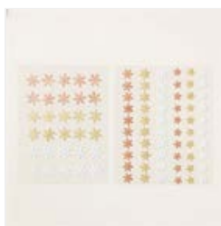
Adhesive-Backed Snowflake Assortment - 162129