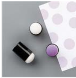
Sponge Daubers - 133773