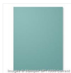
Lost Lagoon 8-1/2" X 11" Cardstock - 133679