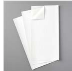
Adhesive Sheets - 152334