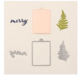
Merry Tags & More Dies - 165639