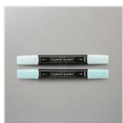
Pool Party Stampin' Blends Combo Pack - 154894