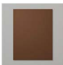
Early Espresso 8- 1/2" X 11" Cardstock - 119686