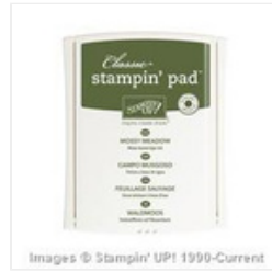
Mossy Meadow Classic Stampin' Pad - 133645