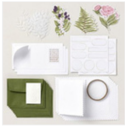
Notes From The Heart Paper Pumpkin Refill - 165640

Tami White tami@stampwithtami.com www.stampwithtami.com