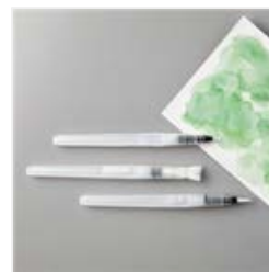
Water Painters - 151298