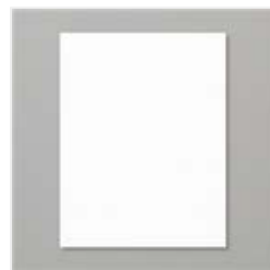
Basic White 8-1/2 X 11 Cardstock - 159276