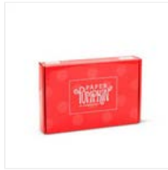
Prepaid Paper Pumpkin Subscription 1-Month - 137858