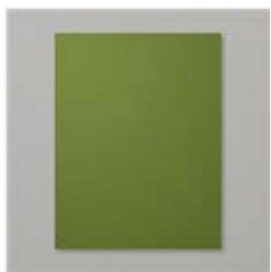
Mossy Meadow 8-1/2 X 11 Cardstock - 133676