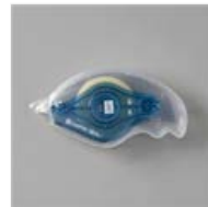
Stampin' Seal+ - 149699