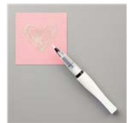
Wink Of Stella Clear Glitter Brush - 141897