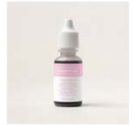
Bubble Bath Classic Stampin' Ink Refill - 161670