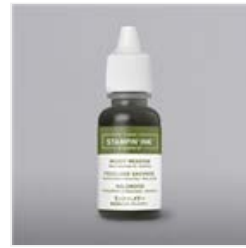
Mossy Meadow Classic Stampin' Ink Refill - 133651