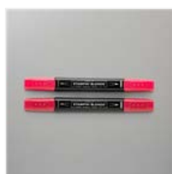
Real Red Stampin' Blends Combo Pack - 154899