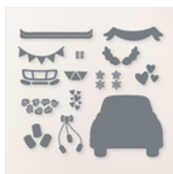
Classic Wedding Dies - 164887