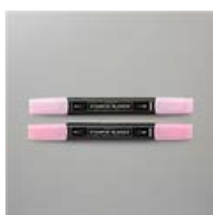
Flirty Flamingo Stampin' Blends Combo Pack - 154884