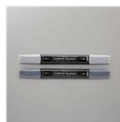
Basic Black Stampin' Blends Combo Pack - 154843