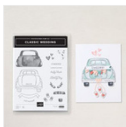
Classic Wedding Photopolymer Stamp Set (English) - 164881