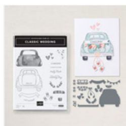
Classic Wedding Bundle (English) - 164888

Tami White tami@stampwithtami.com www.stampwithtami.com