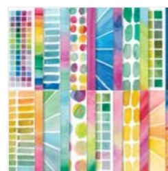
Full Of Life 6" X 6" (15.2 X 15.2 Cm) Designer Series Paper - 163357