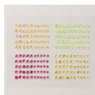
Adhesive-Backed Shiny Sequins - 163484