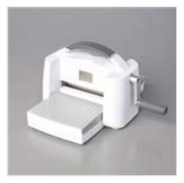
Stampin' Cut & Emboss Machine -149653