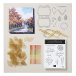
Splendid Autumn Suite Collection (English) - 164062

Tami White tami@stampwithtami.com www.stampwithtami.com