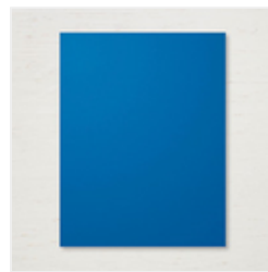
Blueberry Bushel 8-1/2" X 11" Cardstock - 146968