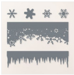
Frozen Edges Dies - 164103

Tami White tami@stampwithtami.com www.stampwithtami.com