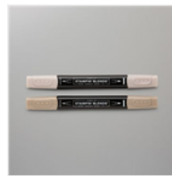
Crumb Cake Stampin' Blends Combo Pack - 154882