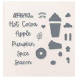
More Than Autumn Dies - 164075