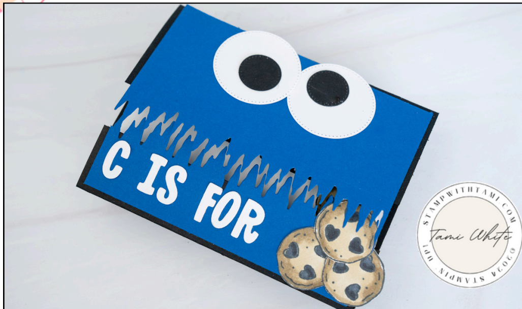
COOKIE MONSTER CARD