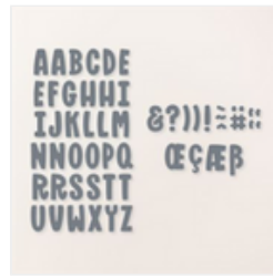
Mini Alphabet Dies - 162934