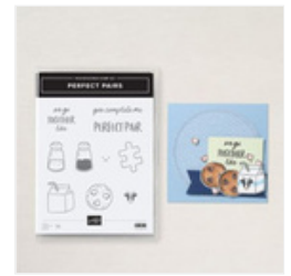
Perfect Pairs Photopolymer Stamp Set (English) - 164898