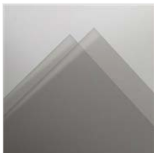
Window Sheets - 142314