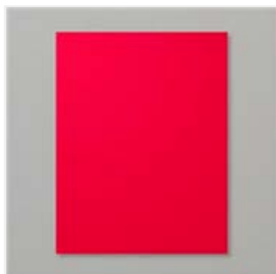
Poppy Parade 8- 1/2" X 11" Cardstock - 119793