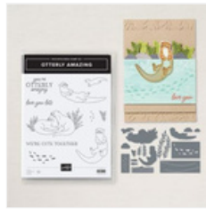
Otterly Amazing Bundle (English) - 164933