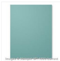
Lost Lagoon 8-1/2" X 11" Cardstock - 133679