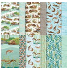
Otterly Adorable 12" X 12" Designer Series Paper - 164936