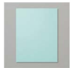
Pool Party 8-1/2" X 11" Cardstock - 122924