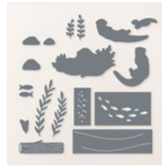
Otterly Amazing Dies - 164932