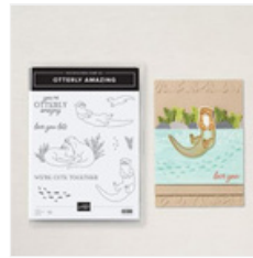
Otterly Amazing Photopolymer Stamp Set (English) - 164926