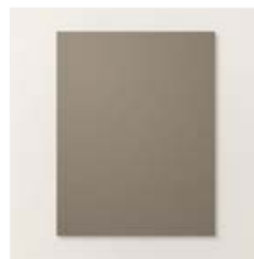
Pebbled Path 8-1/2" X 11" Cardstock - 161722