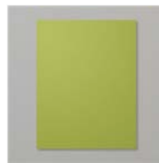
Old Olive 8-1/2" X 11" Cardstock - 100702