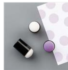
Sponge Daubers - 133773