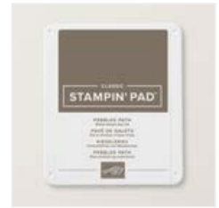
Pebbled Path Classic Stampin' Pad - 161648