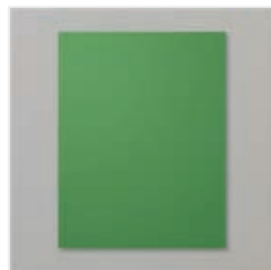
Garden Green 8- 1/2" X 11" Cardstock - 102584