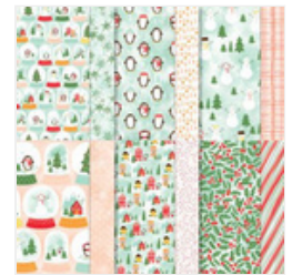
Snowy Scenes 12" X 12" (30.5 X 30.5 Cm) Designer Series Paper - 164333