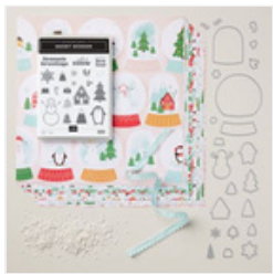
Snowy Scenes Suite Collection (English) - 164130

Tami White tami@stampwithtami.com www.stampwithtami.com