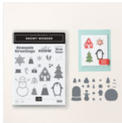
Snowy Wonder Bundle (English) - 164125