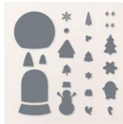
Snowy Wonder Dies - 164124