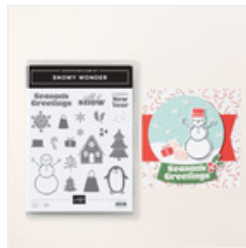
Snowy Wonder Photopolymer Stamp Set (English) - 164334