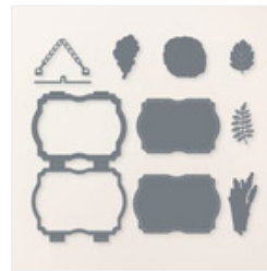
Autumn Expressions Dies - 164055