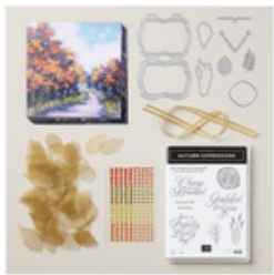
Splendid Autumn Suite Collection (English) - 164062

Tami White tami@stampwithtami.com www.stampwithtami.com