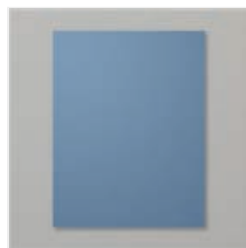
Misty Moonlight 8-1/2" X 11" Cardstock - 153081