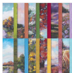
Splendid Autumn 6" X 6" (15.2 X 15.2 Cm) Designer Series Paper - 164173