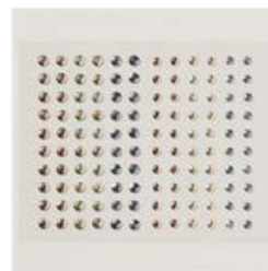
Adhesive-Backed Metallic Gems - 163780