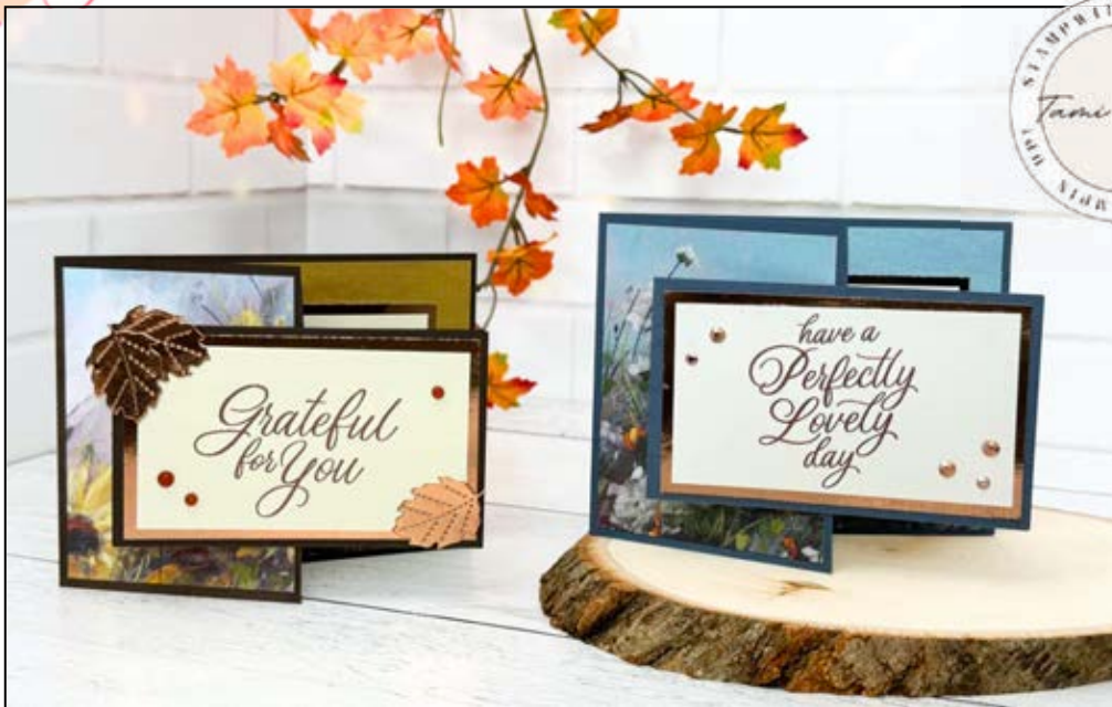
SPLENDID AUTUMN INSIDE OUT FLIP CARDS SEE VIDEO CLASS ON MY BLOG POST