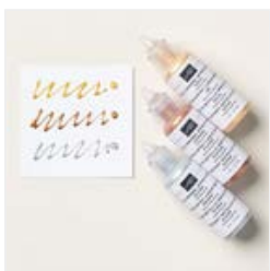
Metallic Enamel Effects Basics - 161610