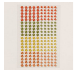
Faux Glass Dots - 164060