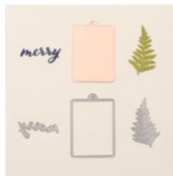
Merry Tags & More Dies - 165639