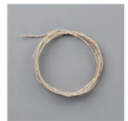
Linen Thread - 104199