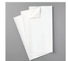
Adhesive Sheets - 152334