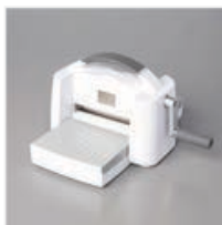
Stampin' Cut & Emboss Machine - 149653