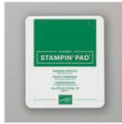
Shaded Spruce Classic Stampin' Pad - 147088