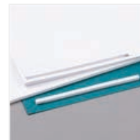
Foam Adhesive Strips - 141825