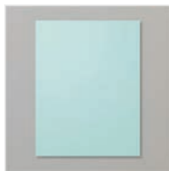
Pool Party 8-1/2" X 11" Cardstock - 122924