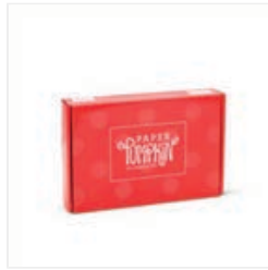
Prepaid Paper Pumpkin Subscription 1-Month - 137858