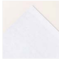
Wood Textured 12" X 12" (30.5 X 30.5 Cm) Specialty Paper - 163770