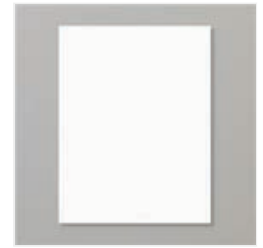
Basic White 8-1/2" X 11" Cardstock - 159276