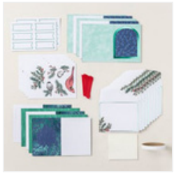
Nests Of Christmas Paper Pumpkin Refill - 165642

Tami White tami@stampwithtami.com www.stampwithtami.com