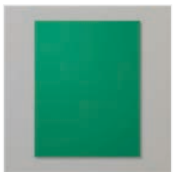
Shaded Spruce 8-1/2" X 11" Cardstock - 146981