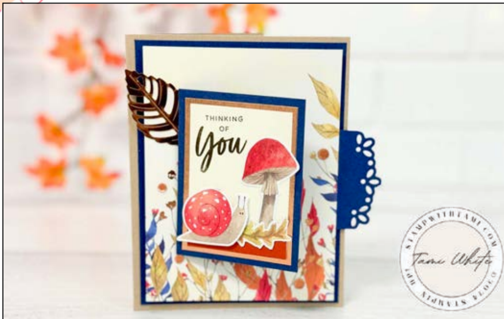
AUTUMN ABUNDANCE PULL TAB FLIP CARD SEE VIDEO CLASS ON MY BLOG POST FOR THE CARD FOLD