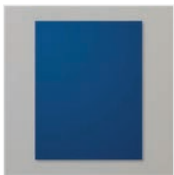
Night Of Navy 8-1/2" X 11" Cardstock - 100867