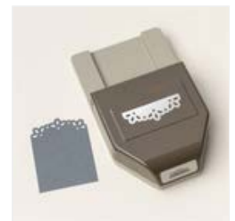
Elegant Edge Tag Topper Punch - 161287