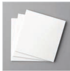
Foam Adhesive Sheets - 152815