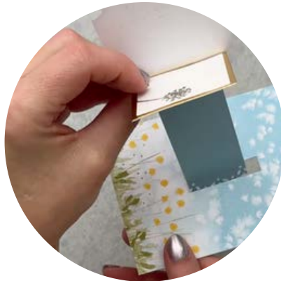
Slide the pull tab through the slot and attach to the back panel. Apply adhesive on the right edge of the inside square.