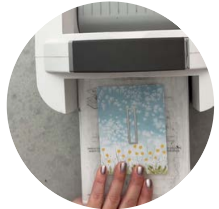
Cut a slot in the center of the printed panel with the small rectangle from the Stylish Shapes dies.