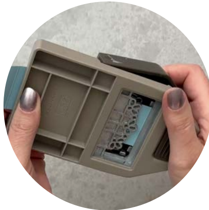
Punch the end of the pull tab with the Elegant Tag Punch.