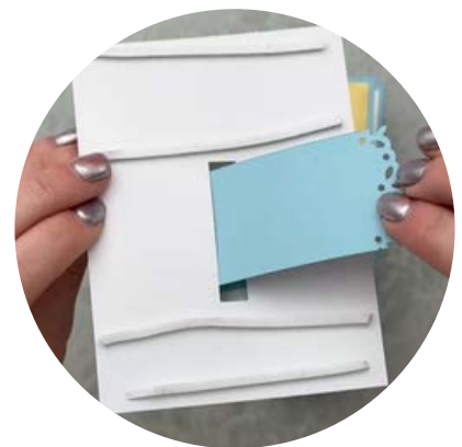
Attach Foam Adhesive Strips to the back of the black panel as shown, then attach to the card base.