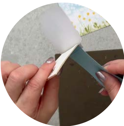
Attach the inside square to the first section of the pull tab, and the front panel to the small spine.