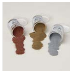
Metallics Wow! Embossing Powder - 165678