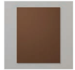
Early Espresso 8- 1/2" X 11" Cardstock - 119686