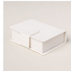
Book Treat Boxes - 164048