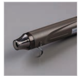
Heat Tool - 129053