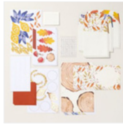
Autumn Abundance Paper Pumpkin Refill - 165077