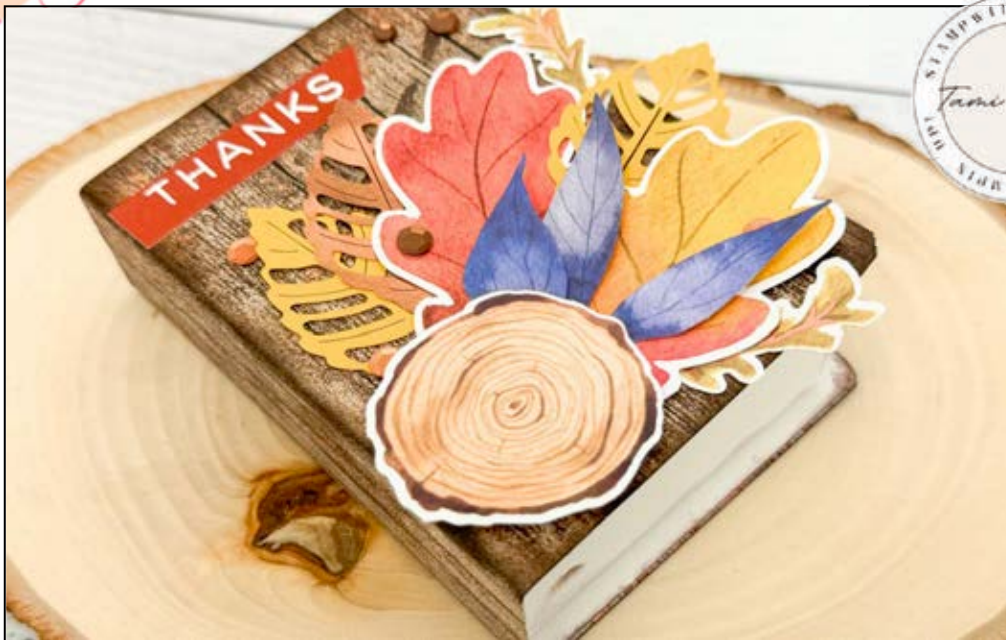
AUTUMN ABUNDANCE BOX SEE VIDEO CLASS ON MY BLOG POST FOR THE CARD FOLD