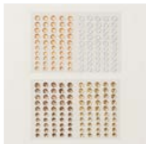
Neutrals Adhesive- Backed Sequins - 161627