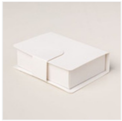
Book Treat Boxes - 164048

Tami White tami@stampwithtami.com www.stampwithtami.com