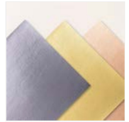
Textured Metallic 12" X 12" (30.5 X 30.5 Cm) Specialty Paper - 163772