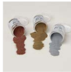
Metallics Wow! Embossing Powder - 165678