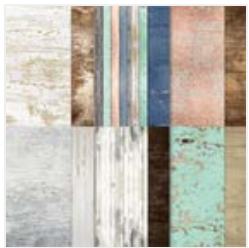
Country Woods 12" X 12" (30.5 X 30.5 Cm) Designer Series Paper - 163393