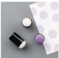
Sponge Daubers - 133773