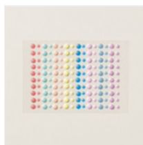
Rainbow Adhesive-Backed Dots - 162758