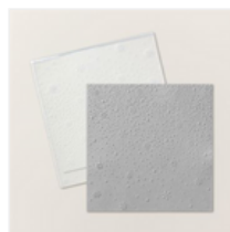
Snowflake Sky 3D Embossing Folder - 162026