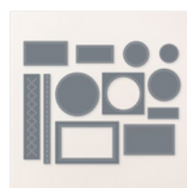
Everyday Details Dies - 162864