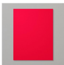
Poppy Parade 8-1/2" X 11" Cardstock - 119793