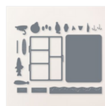
Gone Fishing Dies - 161541