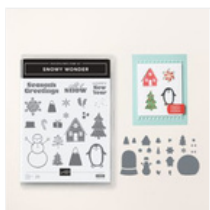
Snowy Wonder Bundle (English) - 164125