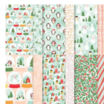
Snowy Scenes 12" X 12" Designer Series Paper - 164333