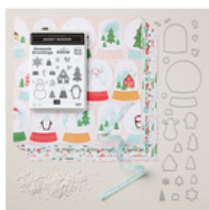
Snowy Scenes Suite Collection (English) - 164130

Tami White tami@stampwithtami.com www.stampwithtami.com