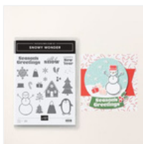
Snowy Wonder Photopolymer Stamp Set (English) - 164334