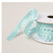
Pool Party 5/8" (1.6 Cm) Pompom Ribbon - 164129