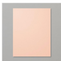
Petal Pink 8-1/2" X 11" Cardstock - 146985