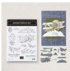
Adventurous Sky Bundle (English) - 163447