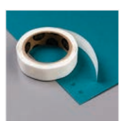
Mini Glue Dots - 103683