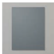
Basic Gray 8-1/2" X 11" Cardstock - 121044