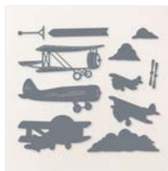
Adventurous Sky Dies - 163446