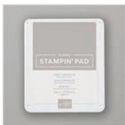
Gray Granite Classic Stampin' Pad - 147118