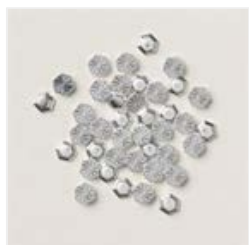
Industrial Trinkets - 163450