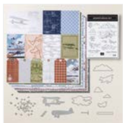
Take To The Sky Suite Collection (English) - 163832

Tami White tami@stampwithtami.com www.stampwithtami.com