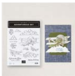
Adventurous Sky Cling Stamp Set (English) - 163439