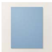
Boho Blue 8-1/2" X 11" Cardstock - 161724