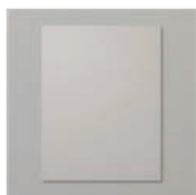
Gray Granite 8-1/2" X 11" Cardstock - 146983