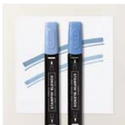
Boho Blue Stampin' Blends Combo Pack - 161659