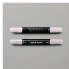
Gray Granite Stampin' Blends Combo Pack - 154886