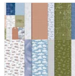
Take To The Sky 12" X 12" (30.5 X 30.5 Cm) Designer Series Paper - 163436