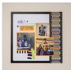
Halloween Memories Scrapbooking Workshop Kit (English) - 166494

Tami White tami@stampwithtami.com www.stampwithtami.com