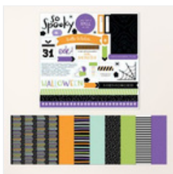
Halloween Spells 12" X 12" (30.5 X 30.5 Cm) Designer Series Paper & Sticker Sheet (English) - 166610