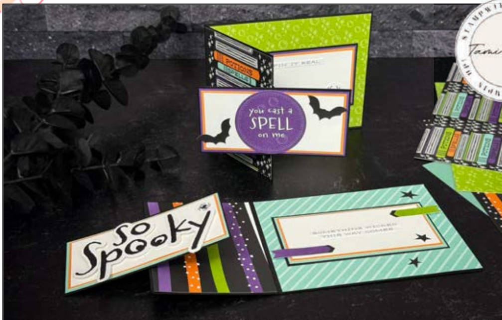
HALLOWEEN MEMORIES INSIDE OUT FLIP CARDS SEE VIDEO CLASS ON MY BLOG POST