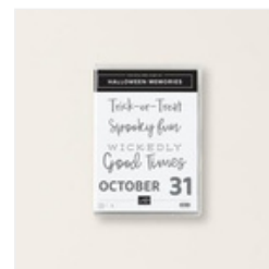
Halloween Memories Photopolymer Stamp Set (English) - 166495