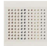
Adhesive-Backed Metallic Gems - 163780