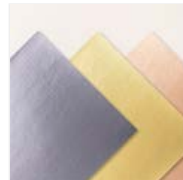
Textured Metallic 12" X 12" (30.5 X 30.5 Cm) Specialty Paper - 163772