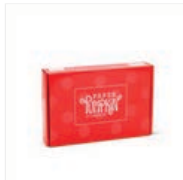
Prepaid Paper Pumpkin Subscription 1-Month - 137858