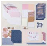
Time For Cake Paper Pumpkin Refill - 165076